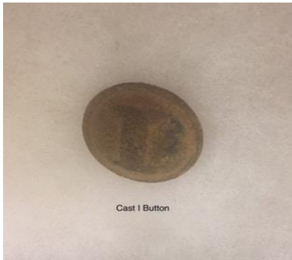
Cast I Button

Here are some relics dug earlier this year by club members.